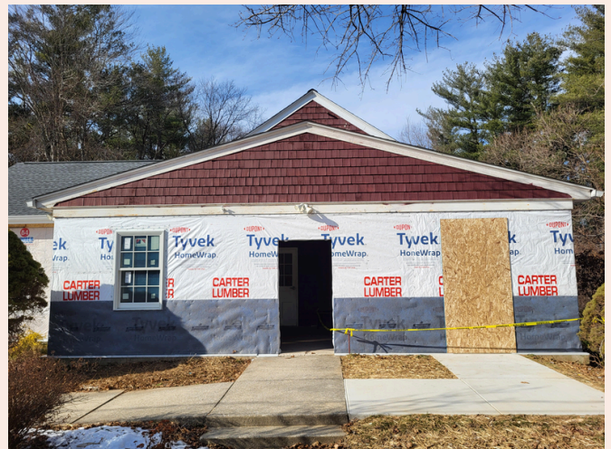
Photos of the building extension and the former front porch.