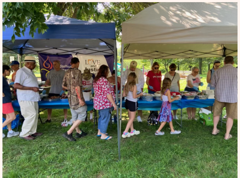
Photos of CUU volunteers serving guests at Shepherd's Staff July 4th at Dutterer's Park.