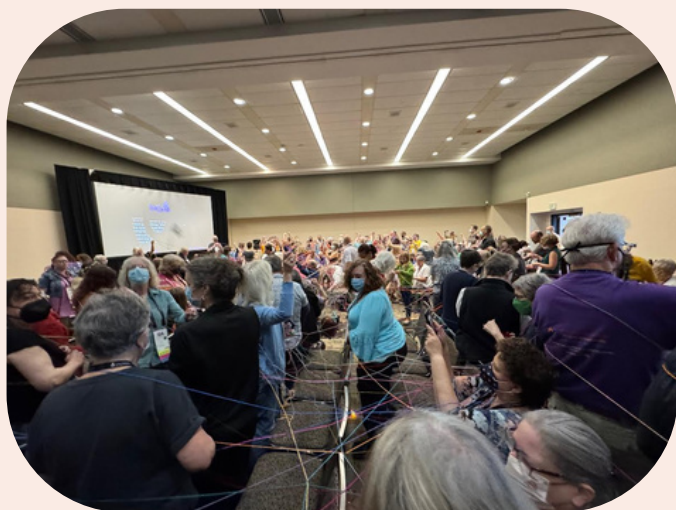
Early morning worship where we created the interdependent web of nature.