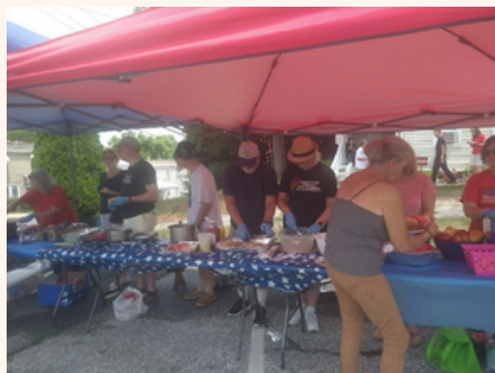
Photo of CUU volunteers serving at Shepherd's Staff July 4th Picnic 2024