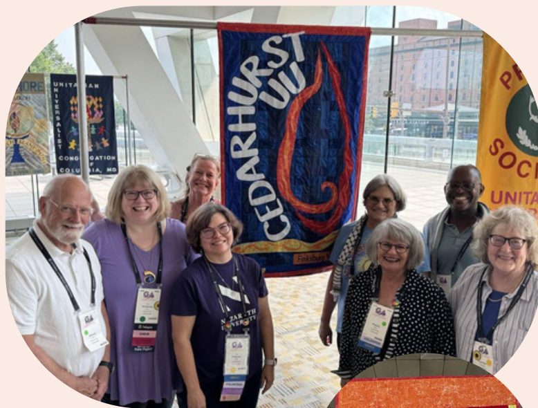
Photo of CUU's new banner, front and back, with eight of ten CUU attendees.