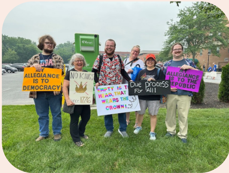
CUU'ers and Friends at Westminster for "No Kings Day"