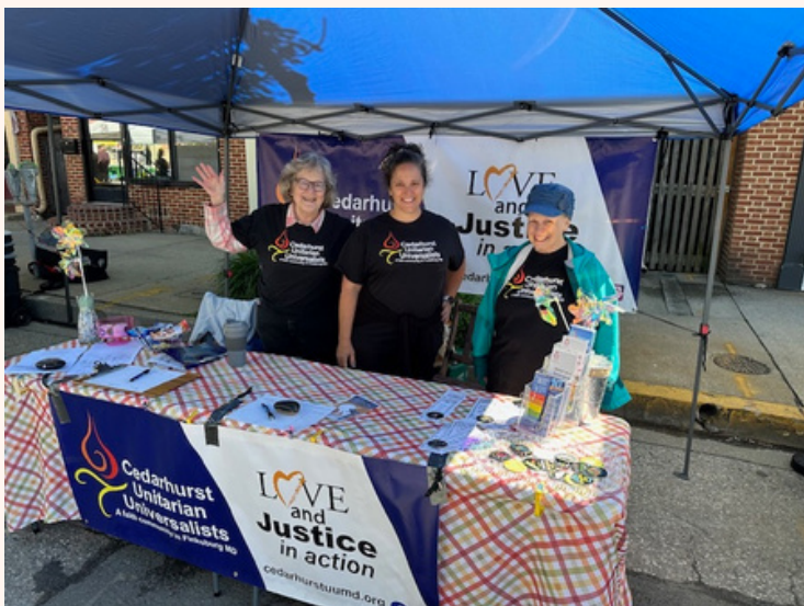
Our Outreach team at the Westminster Flower Festival!