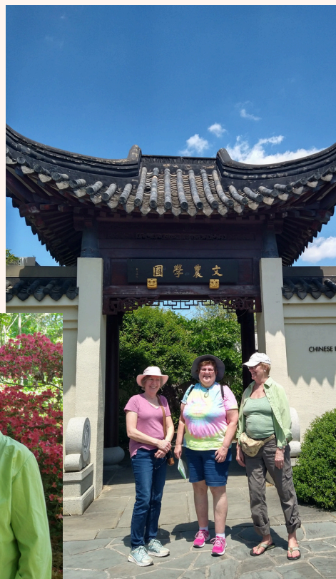
CUU's May 2nd visit the U.S. National Arboretum in D.C.!