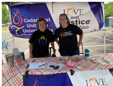
Very Capable booth volunteers!