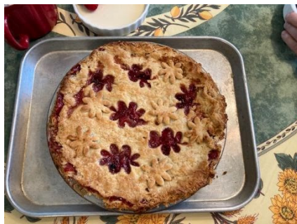
The lively competition was followed by Barb. B.'s homemade desserts and relaxed conversation. All competitors finished the round and ranked in the top 6!